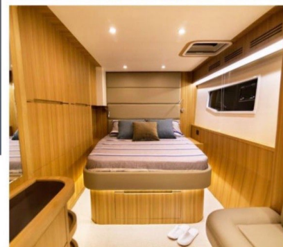
Top: The interior is affordably designed to custom requirements. Middle: The sleek cockpit is spacious and ergonomic. Bottom: The cabins' design evokes the style of luxury apartments.