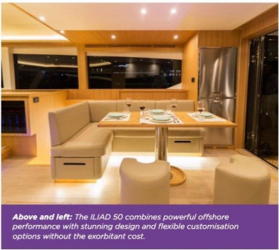
Above and left: The ILIAD 50 combines powerful offshore performance with stunning design and flexible customisation options without the exorbitant cost.

Just like the legendary Achaean ships of Homer's epic, ILIAD's cats are designed to face the most treacherous conditions with confidence. Ideal for extended-passage cruisers, each model affords impressive range and speed with competitive fuel efficiency. The company's standard recommended engines deliver a long-range cruising speed of around seven knots at a fuel burn of less than 1.5 litre per nautical mile with a range of up to 6000 nautical miles (depending on model).